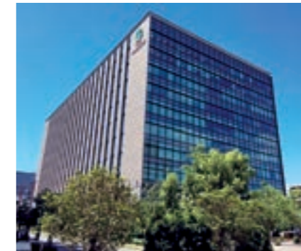
Tokyo Head Office