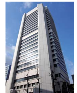
Osaka Head Office