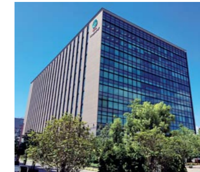
Tokyo Head Office