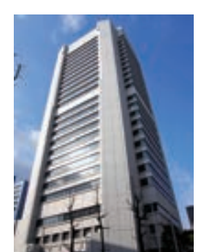
Osaka Head Office