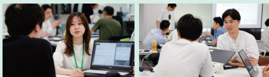
My Purpose Workshop